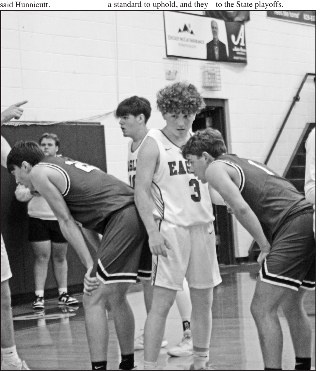
The Towns County men open thier 2024-25 campaign at home vs. No. 9 Union County on Thursday, Nov. 14.