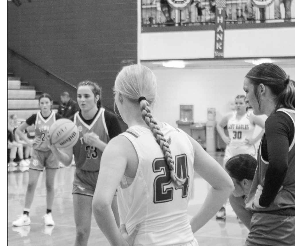
Towns County faced Hiawassee Dam, NC in a scrimmage ahead of Thursday's opener vs. Union County.

Towns County finished "The boys know that there is 2023-24 at 17-11 and advanced